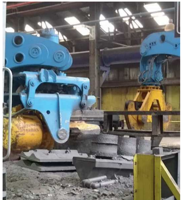
CC1000 Manipulator mounted