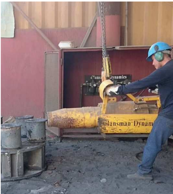
CC112 Crane hook mounted