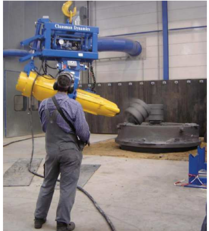
CC2000 Crane hook mounted